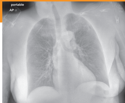
SOFT TISSUE IMAGE